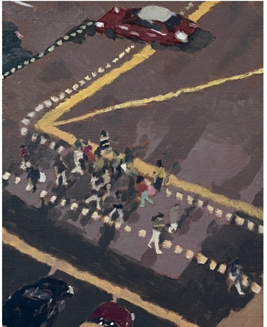
Crossing (2023) by Jeremy Sharma 50 x 40 cm Oil on Linen