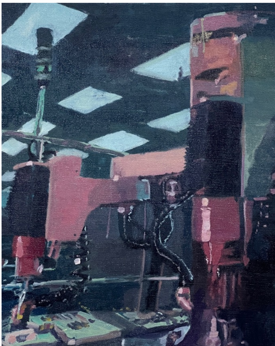
Coral (2023) by Jeremy Sharma 50 x 40 cm Oil on Linen