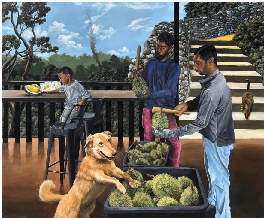
Harvest Party (2024) by Esmond Loh