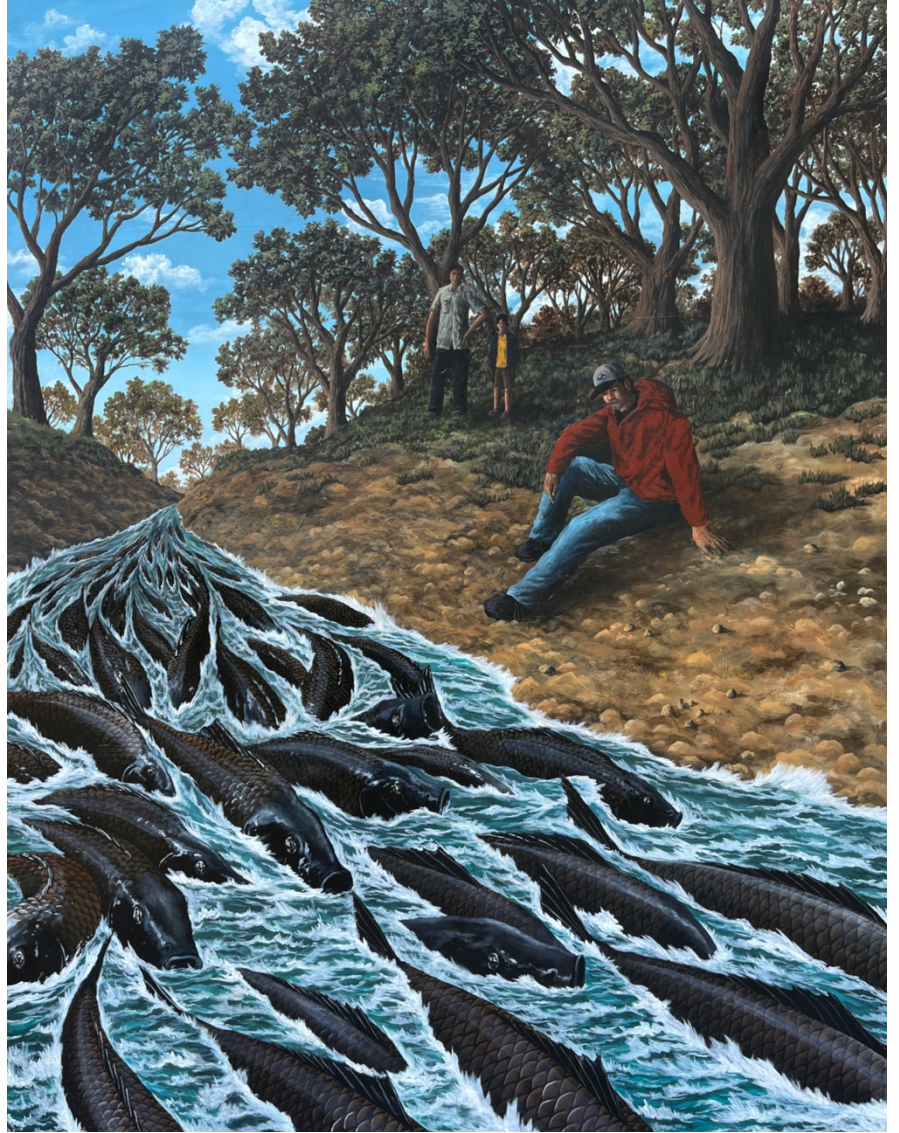
The River (2024) by Esmond Loh 170 x 130 cm Acrylic on Canvas