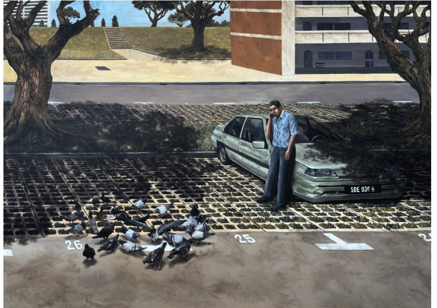
Parking Lot (2024) by Esmond Loh