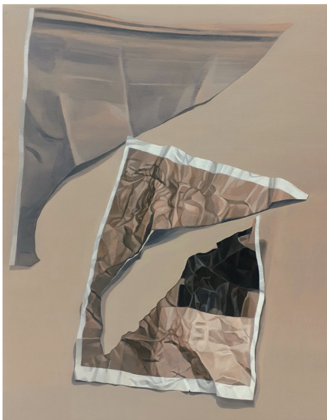
The Escape (2024) by Minstrel Kuik 50 x 40 cm Acrylic on Canvas