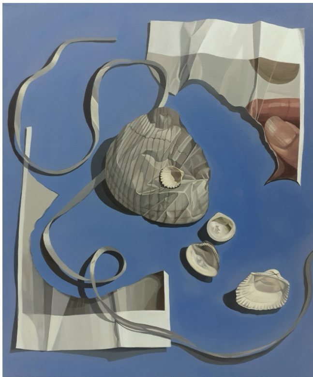
The Latitude of Dream (2024) by Minstrel Kuik 60 x 50 cm Acrylic on Canvas