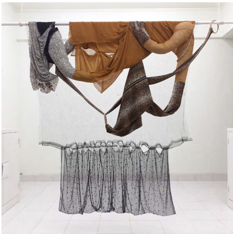
Night's Falling (2025) by Minstrel Kuik 170 x 170 cm Prêt-à-porter garment, polyester fiber filling, wooden ring, textile