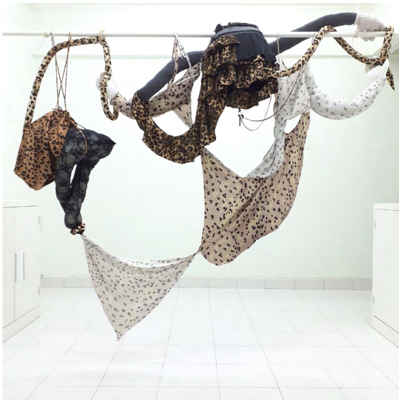
Ways of Attaching (2025) by Minstrel Kuik 210 x 170 cm Prêt-à-porter garment, polyester fiber filling, scrunchy, glove, wooden ring