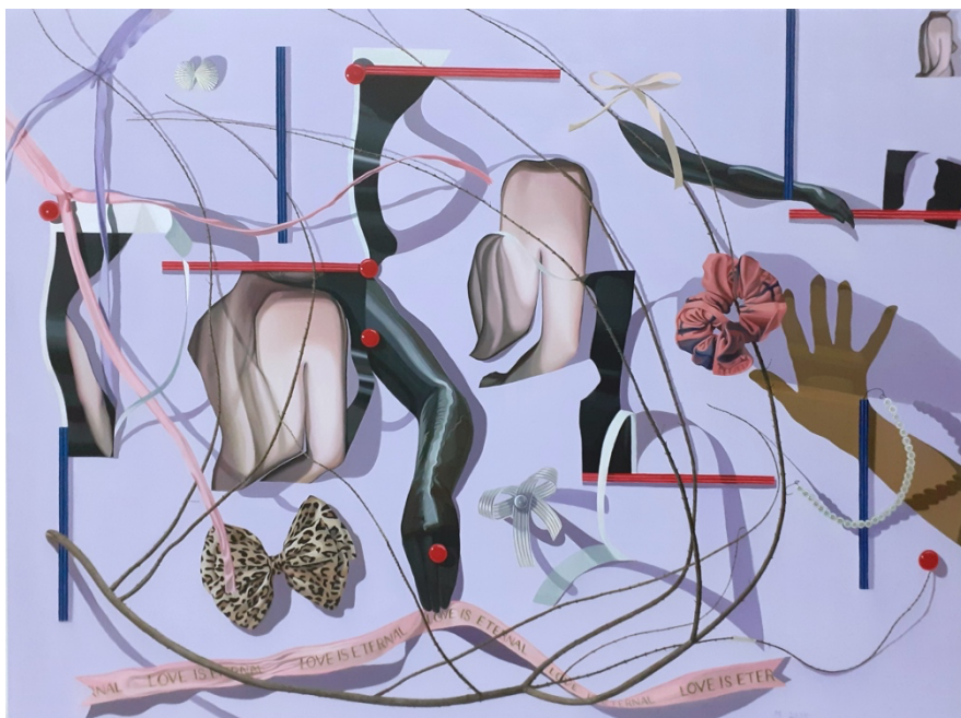
Lovers (2025) by Minstrel Kuik 76 x 102 cm Acrylic on Canvas