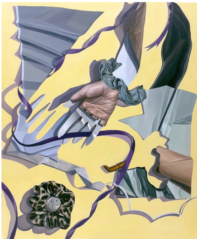
The Probables (2024) by Minstrel Kuik 60 x 50 cm Acrylic on Canvas