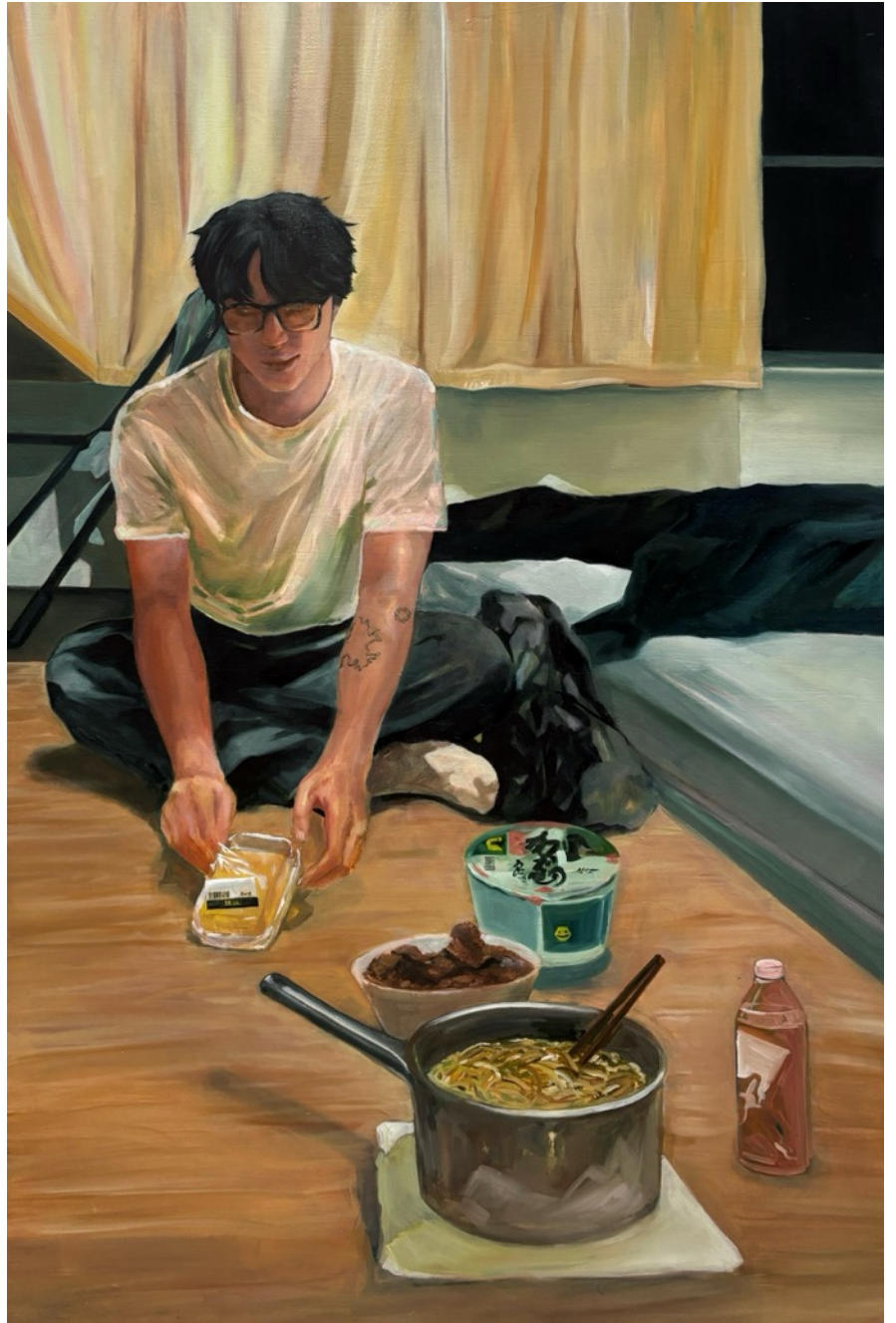
Second Serving (2026) by Lucas Tan 120 x 150 x 5.5 cm Oil on Pinewood