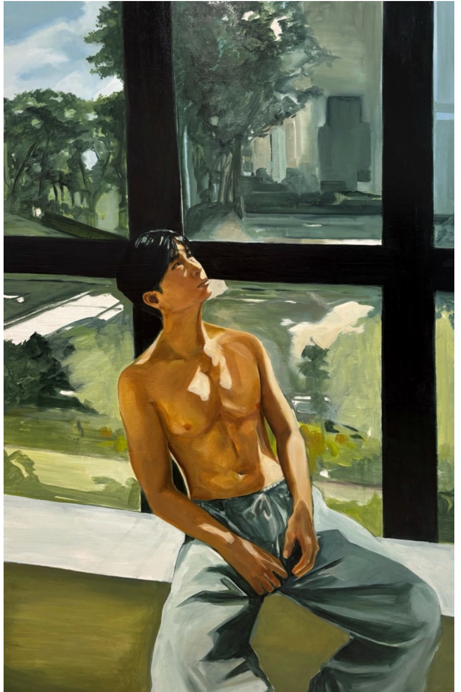
Greener (2026) by Lucas Tan 120 x 80 x 5.5 cm Oil on Pinewood