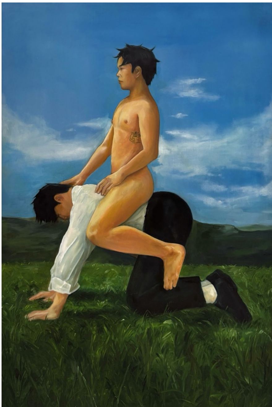
Left Field (2026) by Lucas Tan 150 x 100 x 5.5 cm Oil on Pinewood